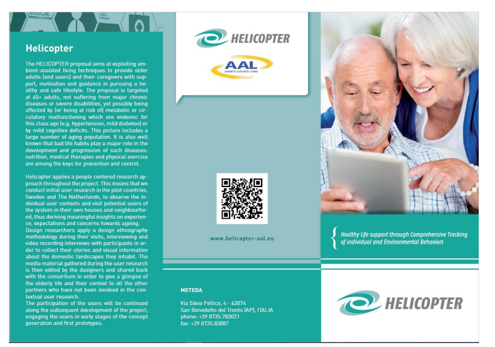
Figure 1_Back Face

The leaflet has been designed in a A4 format coloured sheet, and folded three times as the following image: