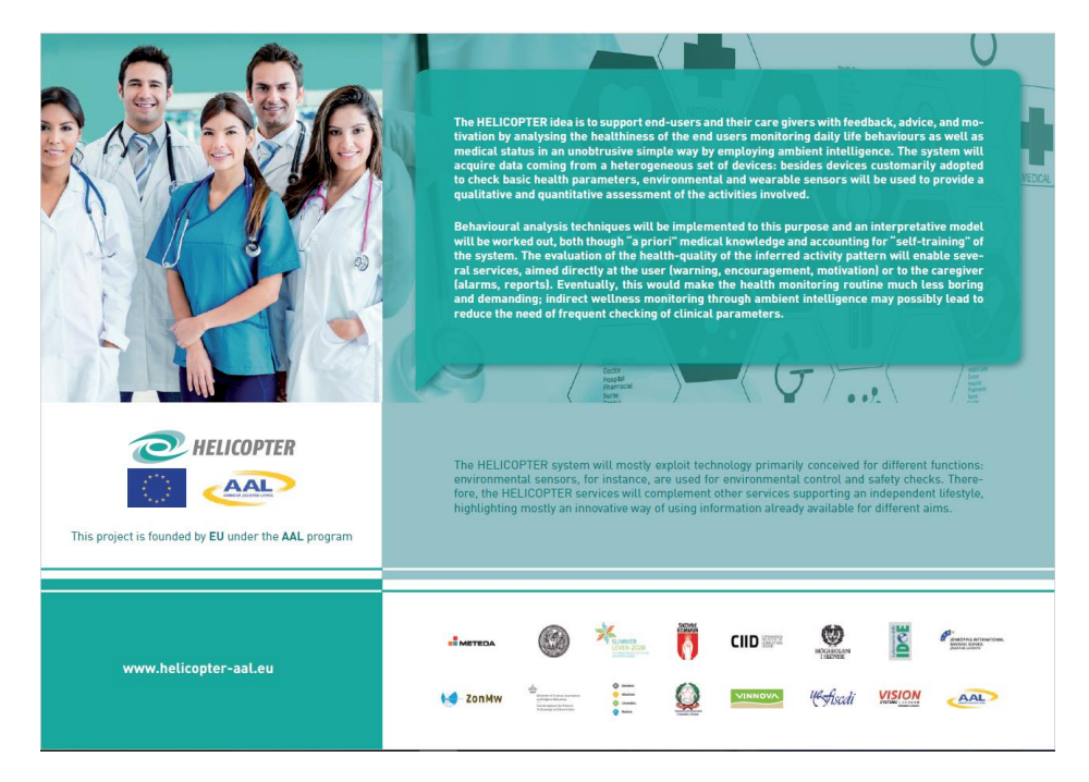
Figure 2_Internal Page