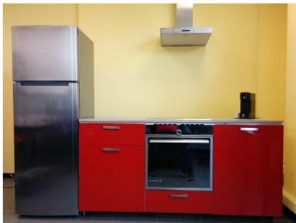
a. the kitchen corner