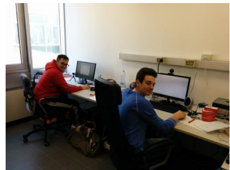
c. Helicopter researchers' desk